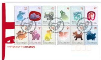
1594252 first day cover (zodiac sheetlet)