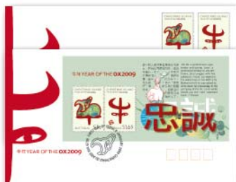
1594002 first day cover (gummed) 1594013 first day cover (minisheet)