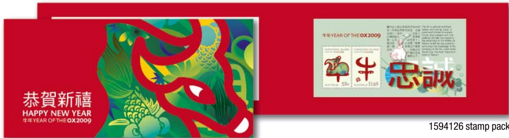
1594126 stamp pack

The stamps feature the calligraphic symbol for the Ox and its pictorial derivation. People born in Ox years include Princess Diana, Charlie Chaplin and Napoleon. Ox years over the last century were 1901, 1913, 1925, 1937, 1949, 1961, 1973, 1985 and 1997. The stamp pack doubles as a greeting card and can be sent to family and friends within Australia and overseas using the matching PPE and IPPE.