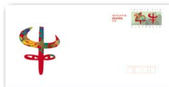
1594231 ppe (domestic)