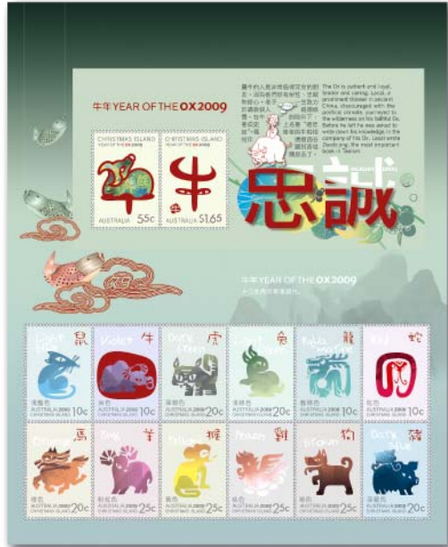
1594098 zodiac sheetlet

Each year Australia Post issues a stamp to celebrate lunar new year, which is the most important of the traditional Chinese festivals. It is celebrated by Chinese people throughout the world. The Chinese zodiac is made up of a 12-year cycle and Chinese animal signs are used for dating the years. The recurring animal cycle is Rat, Ox, Tiger, Rabbit, Dragon, Snake, Horse, Goat (or Sheep), Monkey, Rooster, Dog and Pig. The next lunar new year is the Year of the Ox, which begins on 26 January 2009.