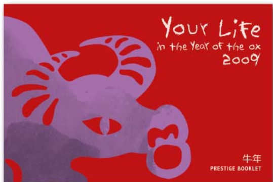
1594184 prestige booklet (cover shown here)

This limited edition 2009 LNY: Year of the Ox display set features a silver ingot replicating the 55c stamp artwork in relief. Also included is the 2009 LNY: Year of the Ox miniature sheet. Only 1,000 have been produced. The set comes with a certificate of authenticity and is housed in a wooden box to enhance and protect. Available while stocks last.