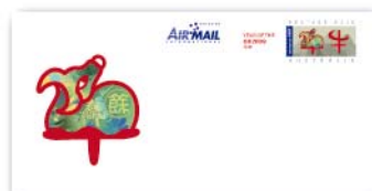
1594232 ippe (international)