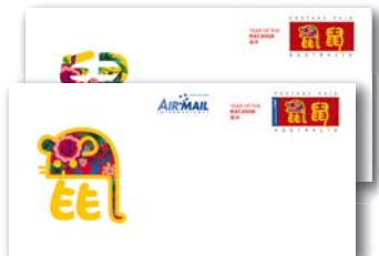
1555231 PPE (domestic)