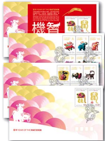
1555001 set first day covers