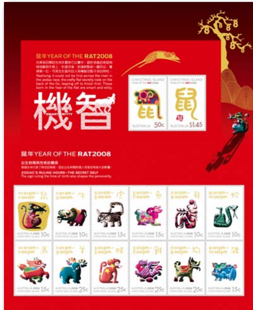
1555098 zodiac sheetlet