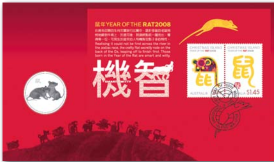
1555008 postal and numismatic cover featuring Lunar New Year minisheet – 2008 Issue 1

Australia Post will include a seal of authenticity and official number on all stamp and coin covers from January 2008. This is the first Australian issued stamp and coin cover to use the identifying process!